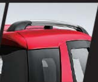
Sporty Roof Rail