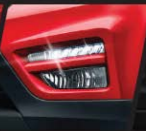
LED Daytime Running Light