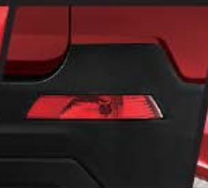
Rear Fog Lamp