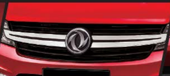
Sporty Wing Shaped Grille