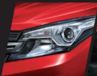
Hawk Eye Shaped Headlamp