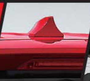
Shark Fin Antenna